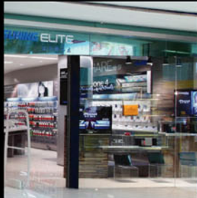
SUNINGelite holiday plaza, shenzhen