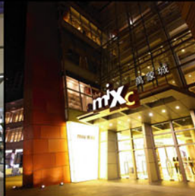
mixc 万象城 mixc shopping center, shenzhen