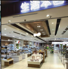
生活本色 better living mixc shopping center, shenzhen